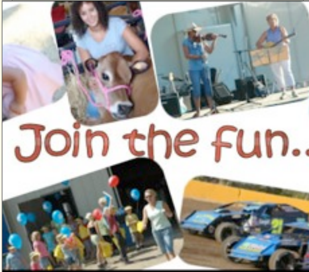
THE HISTORIC SPICER CASTLE ON GREEN LAKE - 1895

DEMOLITION DERBY THURS. AUG. 9 & SAT. AUG. 11, 2012