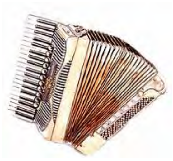
HARRINGTON ARTS CENTER