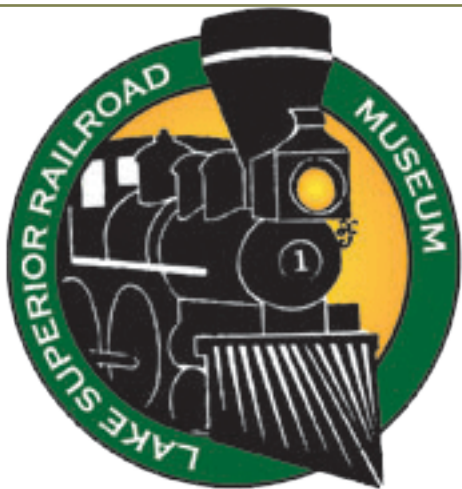
SCENIC RAILROAD TO TWO HARBORS

Imagine the sun rising over clear blue waters, white fluffy clouds, a gentle breeze blowing, the slap of gentle waves washing up on the pebble beaches of Lake Superior, then in the distance the appearance of white sails, masts of tall timbers, bodies scrambling up the masts controlling the white of the silk sail. Step back into the era of the "Tall Ships" in a time 200 years ago.