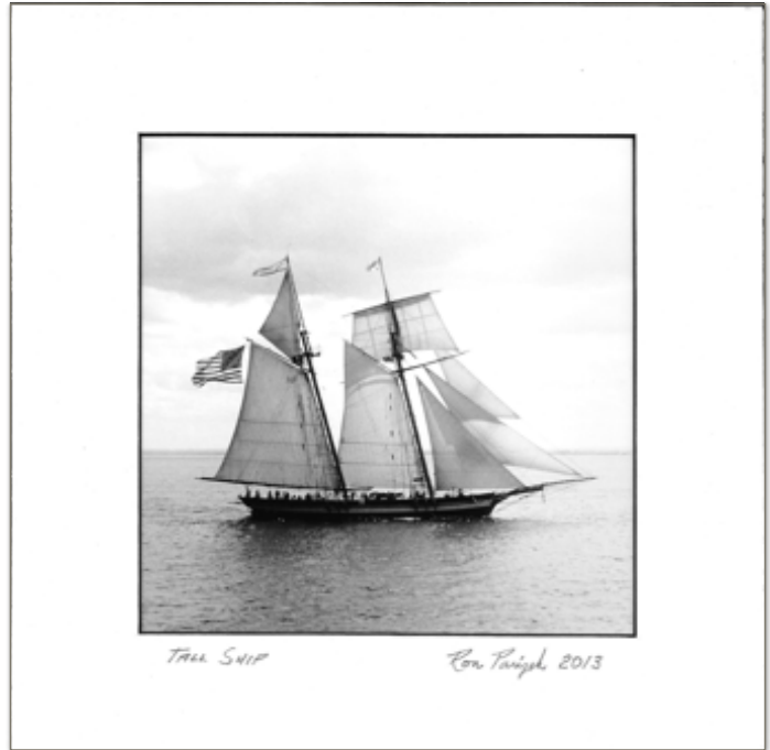
This beautiful picture was taken by Ron Parizek at the 2013 Tall Ships Rally from the deck of the ship Vista Cruise where you will watch the ships of years gone by come into the Duluth harbor.

FESTIVAL OF THE TALL SHIPS DULUTH, MN AUG. 17-21, 2016